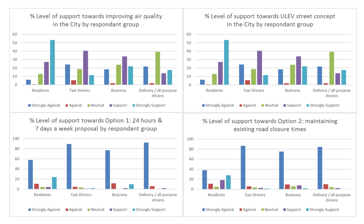
377 out of 682 survey responders also commented on the proposal. Comments received are detailed below